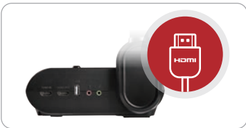
Image Streaming via HDMI Connectivity

Bend and adjust the gooseneck whatever you need to make the sample be seen crystal clear. Students will miss any details no more.